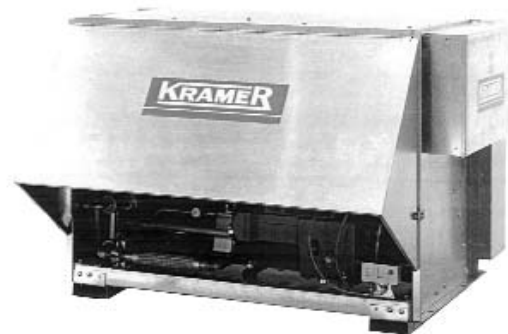
SIZE 0400 - 1200