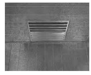
The evaporator section mounts flush in the standard 4"-thick ceiling panel.